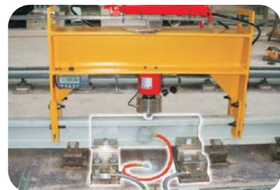
Trakmate test press is used for on-site calibration - no test train required