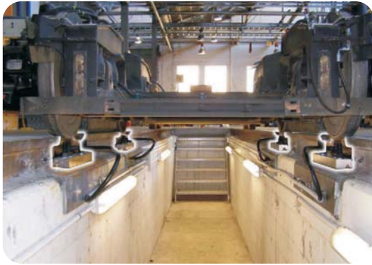
Trakmate 1 in-line loadcells

Trakmate is a new and unique concept design for the weighing and balancing of any type of rail vehicle. It is the real solution for weighing and balancing in all manufacturing, rail maintenance workshops or other suited applications.