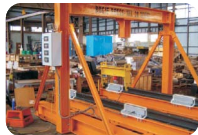
Bogie balancing press fitted with Trakmate loadcells