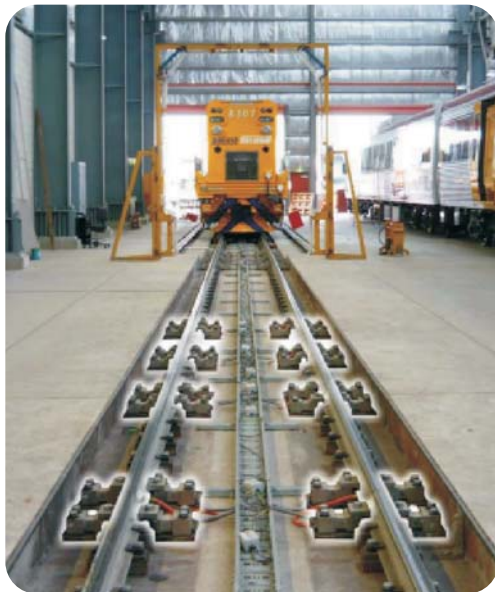
Trakmate 2 loadcells under rails